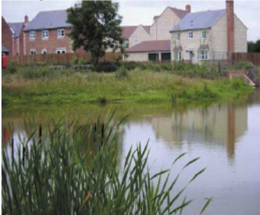
SUDS pond, housing development, Bicester